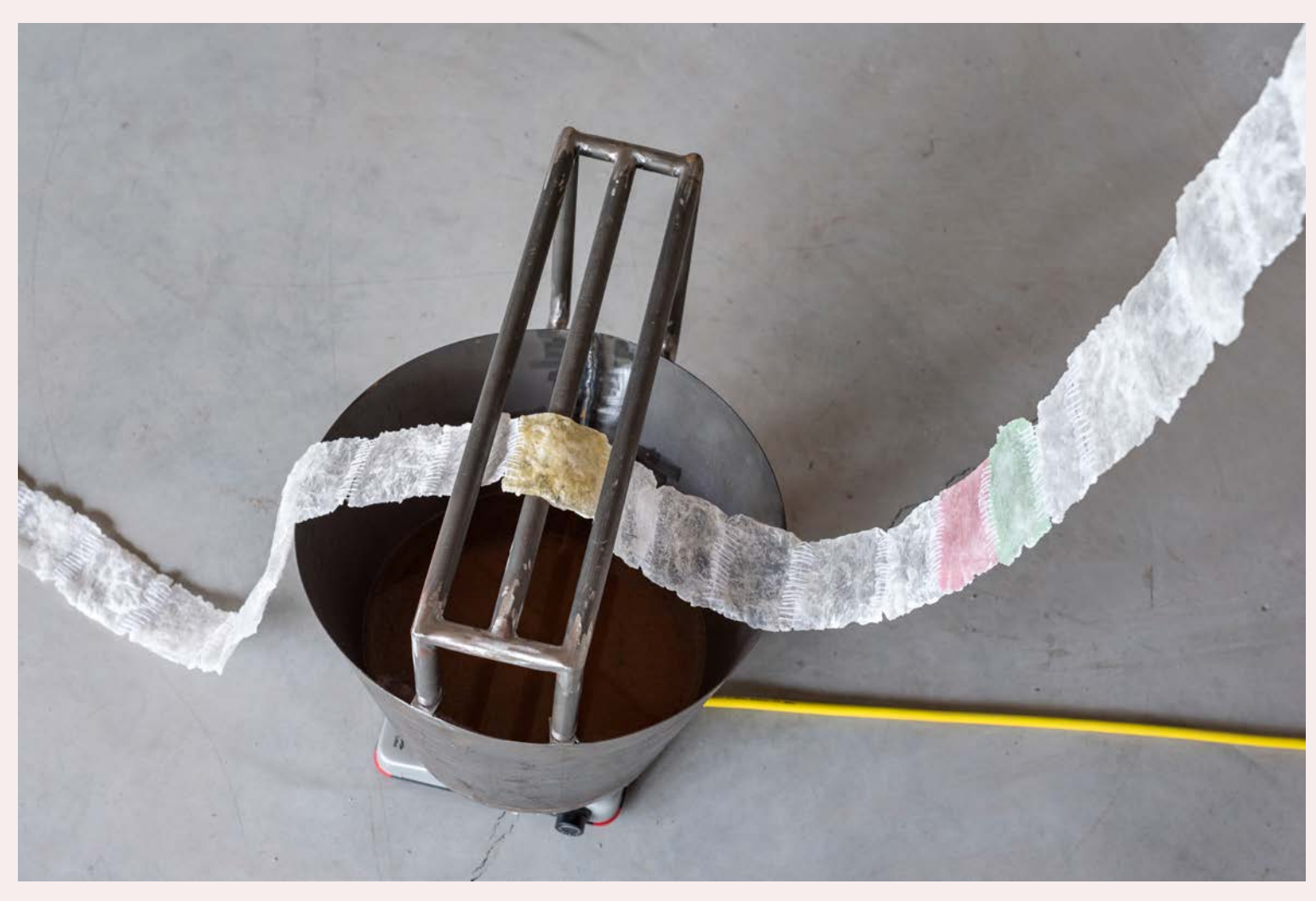
Gülşah Mursaloğlu. Merging Fields, Splitting Ends. 2021. Potato-based bioplastic, thread, steel, water, heating plates. Dimensions variable. Photography by Zeynep Fırat. © Gülşah Mursaloğlu and Protocinema

to muffle sound in recording studios, from a wooden skeleton, then spills them out in waves across the floor. The work also recalls Kundura's current use as a film set for television and movie productions. The flimsy façades of imagined Istanbul neighbourhoods are "all a shell, or skin, that we shed and yet it black letter-shaped mylar balloons floating near Kundura's carries forth the past," the artist explained.