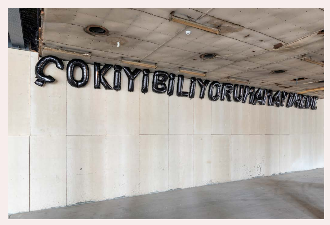
Banu Cennetoğlu. IKNOWVERYWELLBUTNEVERTHELESS. 2015-ongoing. 24 helium-inflated mylar balloons. Image courtesy of the artist and Rodeo Gallery, London/Piraeus. Photography by Zeynep Fırat. © Banu Cennetoğlu