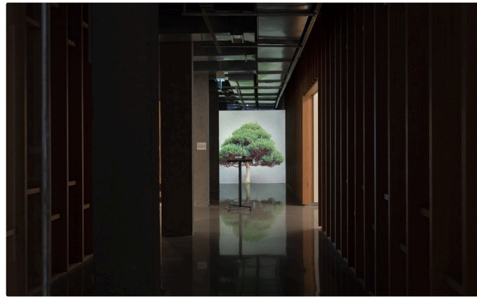
“Tree Story,” 2021, installation.